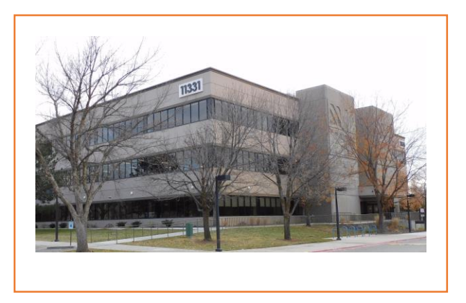
PUC Headquarters 11331 W. Chinden Blvd., Building 8 Suite 201-A, Boise, Idaho 83714.

Typically, decision meetings consist of the commission's review of decision memoranda prepared by commission staff. Minutes of the meetings are taken. Decisions reached at these meetings may be either final or preliminary, but subsequently become final when the commission issues a written order signed by a majority of